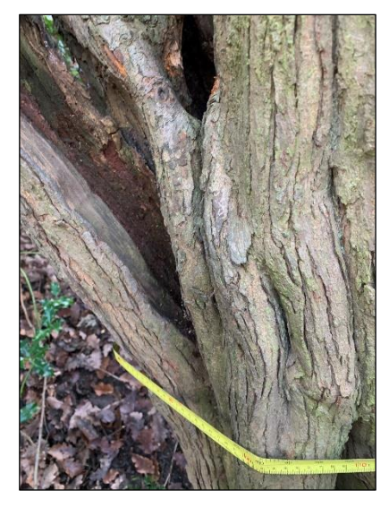
Tree 12 HAWTHORN: Original measurement 2.28m, measured 0.5m from back of tree below split. Check measurement 9/1/21: 2.33m measured below split.