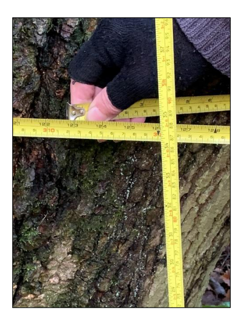
Tree 5 HAWTHORN: Original Measurement 1.3m measured below the split, but was a complicated tree to measure. Check measurement 9/1/21: 1.37m