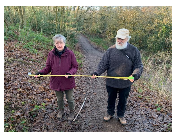
Tree 1 OAK: Original Measurement 3.5m measured below the split, including bulge. Check measurement 9/1/21: 3.13m excluding bulge.