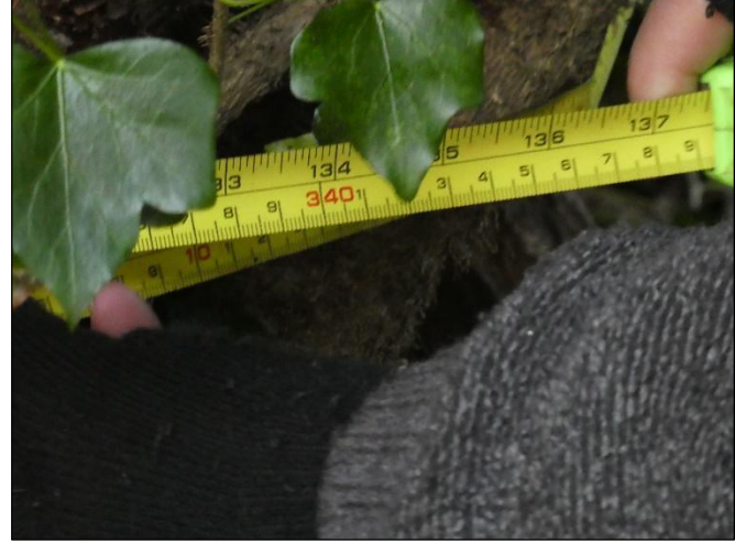
Tree 9 HAWTHORN: Original Measurement 1.8m measured below the split, but was a complicated tree to measure. Check measurement 9/1/21: 1.98m measured below split.