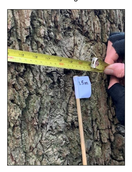
Tree 14 HAWTHORN: Original measurement 2.15m, measured 0.5m from back of tree below split. Check measurement 9/1/21: 1.85m measured below split.