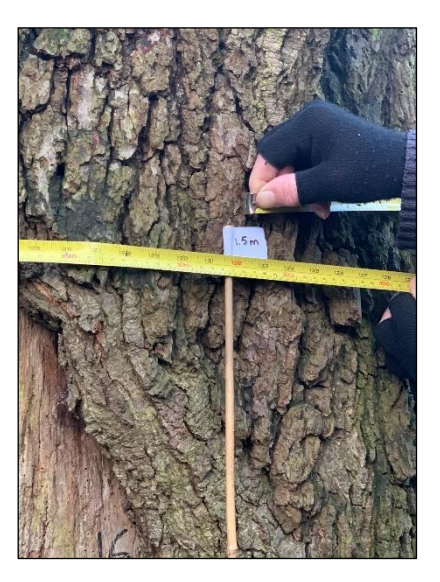
Tree 17 HAWTHORN: Original measurement 1.5m, measured 0.5m from ground level at back of tree below split. Check measurement 9/1/21: 1.70m measured below split 0.5m from ground level at back of tree.