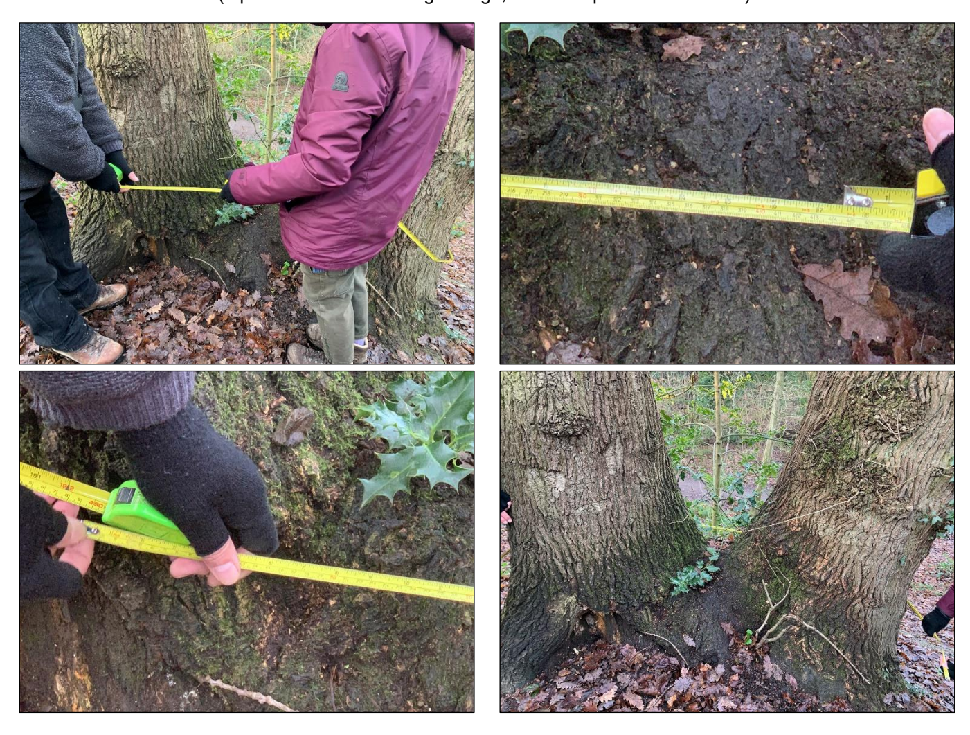
Tree 11 HAWTHORN: Original measurement 1.38m, measured 1m above ground level. Check measurement 9/1/21: 1.39m measured at 0.64m above ground level but below bulge in tree. Complicated tree to measure.