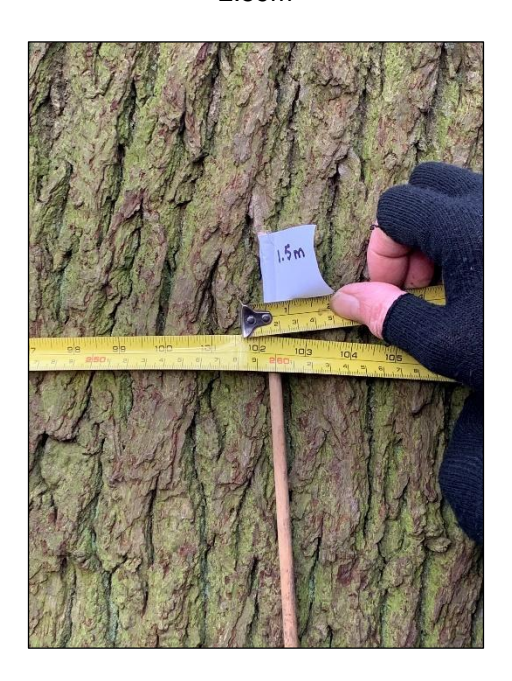
Tree 8 SILVER BIRCH: Original Measurement 4m measured 0.5m above ground level. Check measurement 9/1/21: 3.3m, measured below widening of trunk.