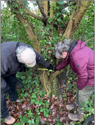
Tree 6 OAK: Original Measurement 3.15m measured below the split. Check measurement 9/1/21: 2.8m, but measured at narrowest point (see picture).