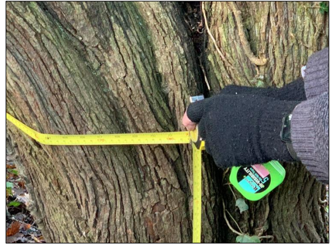
Tree 16 ALDER: Original measurement 3.5m, measured 1.5m from ground level. Check measurement 9/1/21: 3.36m measured 1.5m from ground level.